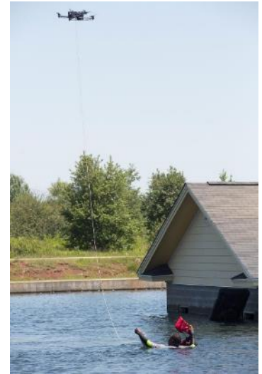
Figure 5 - Drone monitored by aegex10 Tablet managing victim relief

Network connectivity proved to be a critical priority in response and recovery. Loss of communications among members of a mobile response team, plus the inability to communicate with stranded victims and real-time sensing systems, highlighted the need for a rapidly deployable network. Redundancy of radios in devices provided flexibility in this approach, and therefore, many risks could be mitigated.