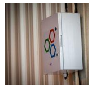
Aegex LoRa - Wi-Fi Gateway

©Aegex Technologies LLC – September 2018