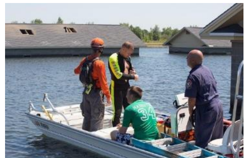
Figure 4 - Scene from Flood Test Scenario #1

A hurricane approaches a city, but complacent residents and business owners fail to take necessary precautionary measures. The hurricane strikes the city, and water rises 2 meters, trapping victims and damaging utility and communications infrastructure. Submersed hazards are in the water, impeding the rescue. Victims (actors) create distractions while demanding rescue, which puts first responders further at risk.