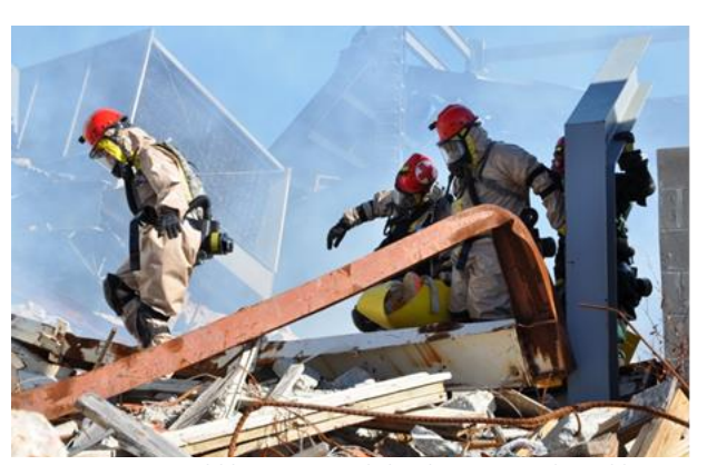
Figure 8 – IoT could have averted the disaster, and used here by First Responders on site, to aid in Search and Rescue

A chemical company's IT department had moved to a full IoT deployment of connected workers and operations. overlaying new intrinsically safe sensing devices rather than relying solely on legacy sensors and manual rounds management. The Operations and Maintenance team elected to continue a "business-as-usual" approach. Workers recorded rounds on paper forms, processed paper hot work permits, and updated systems at the end of shifts. Large areas of fail-points were not monitored by legacy explosion-proof