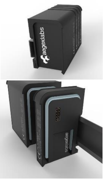
Figure 9 - First Generation Aegex Intrinsically Safe Configurable IoT Sensors

✓ A single or dual gas sensor in an explosion-proof housing requires significant time and expense to install and integrate into process control systems. Costs can exceed USD$25,000 for a single piece of equipment and installation. Battery-powered and wireless intrinsically safe sensors that can capture up to 36 simultaneous and independent inputs enable far greater insights and artificial intelligence.