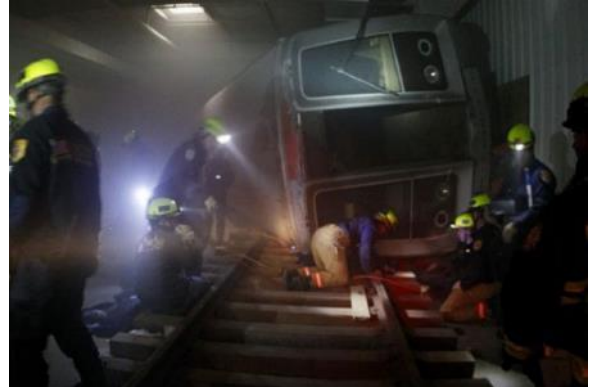
Figure 11 - Subway Tunnel Explosion Test with overturned rail car in the tunnel

To test the Hypothesis, numerous technologies were assessed that met the