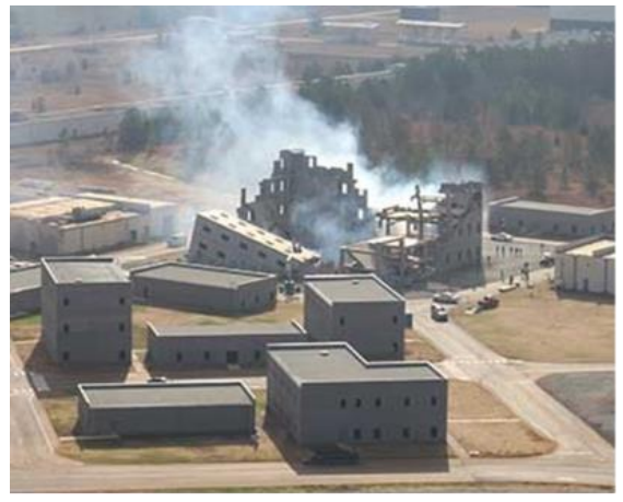
Figure 7 – View of Chemical Plant Explosion Test Scenario underway.

Sensors are deployed at a chemical processing facility with a plan for a full IoT deployment. Data is captured that detects anomalies in pipe and flange vibration and temperature variations. A digital "fingerprint" in the dataset suggests a pending leak but goes un-attended. A tornado is reported in the area, and high winds hit the already-comprised facility. Anomaly alerts show hydrocarbon vapors are detected, and an explosion occurs, collapsing the building, trapping victims and impacting the neiahborina community. Atmospheres containing high concentrations (greater than ppm) are considered immediately 100 dangerous to life and health (IDLH), and a self-