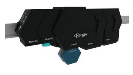
Figure 14 - Aegex Technologies Next Generation IoT Solution

Some disasters cannot be prevented. But many can, or at least the impact can be minimized with better data and better communications. Monitoring conditions surrounding critical assets and operations can help organizations be prepared if problems arise. With current and accurate information, emergency response can be more coordinated, efficient and safe.